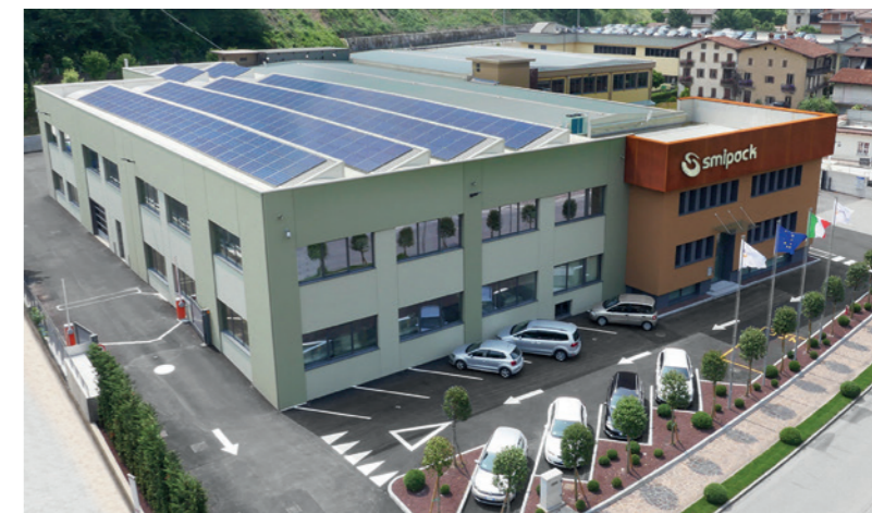
In the modern and functional SMIPACK headquarters in San Giovanni Bianco (Bergamo), all design, assembly, sales and after-sales activities are performed.

SMIPACK machines are designed to offer all the advantages of IoT (Internet of Things) solutions for data and information exchange through 4.0 Factory supervision and control systems.